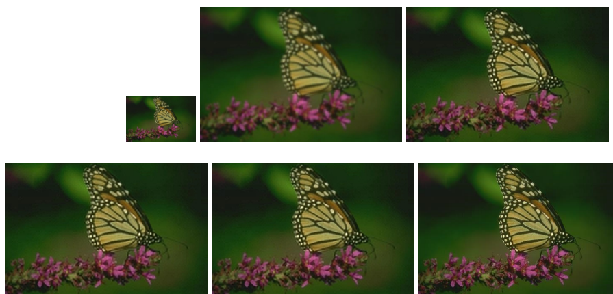
Fig. 3. The super-resolution results (scaling factor 3) on image Butterfly . Top row: LR image, bicubic interpolation (PSNR= 29.57 dB, SSIM = 0.8847), method [15] (PSNR = 31.57 dB, SSIM= 0.9095). Bottom row: single dictionary-pair (PSNR = 32.09 dB, SSIM = 0.9207), two dictionary-pairs (PSNR = 32.66 dB, SSIM = 0.9320), Original HR image.